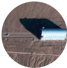
Daytime Get insights in time to decide