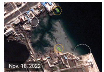
Haeju, North Korea Detect reported changes in number and position of vessels at Naeju Naval Base.