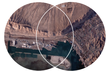
Area 2x1 See larger areas