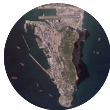
Stereo Build your own 3D products